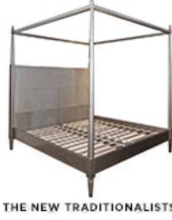
THE NEW TRADITIONALISTS