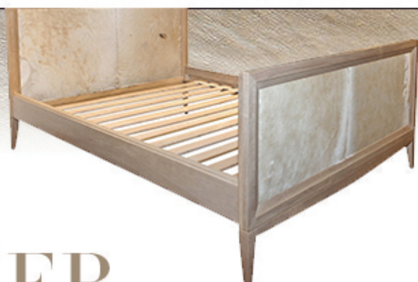
THE NEW TRADITIONALISTS PONY UPHOLSTERED BED