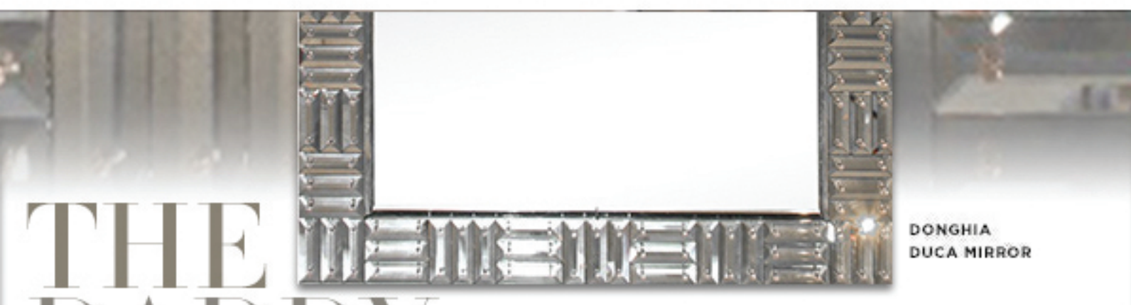
DONGHIA DUCA MIRROR