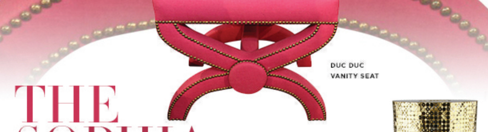
DUCDUC VANITY SEAT