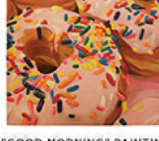
"GOOD MORNING" PAINTING