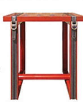
THE NEW TRADITIONALISTS